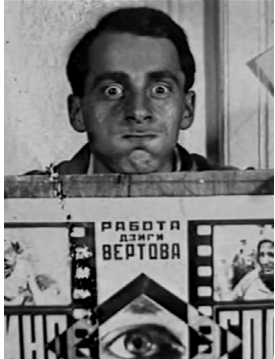
Director Dziga Vertov and his poster for Film-Eye , 1924

This incredible period of unbridled optimism and experimentation, however, was short lived. In the aftermath of Lenin’s death in January 1924, it soon became clear that these ambitious posters better reflected the early idealism of the Revolution than the draconian dictatorship slowly strangling society under Stalin. By the 1930s, the government that had supported and funded the production of innovative,