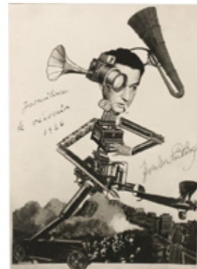
The Racing Reporter (1926), Otto Umbehr