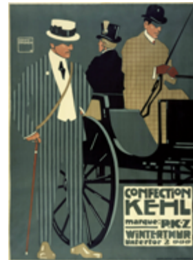
PKZ (1908), Ludwig Hohlwein