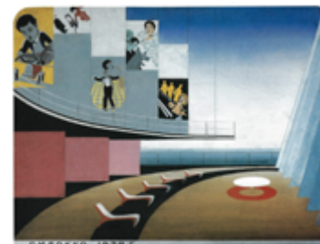
Sirocco Set Design (1928), Vladimir Stenberg