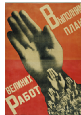
Let's Fulfill the Plan of Great Works (1930), Gustav Klutsis