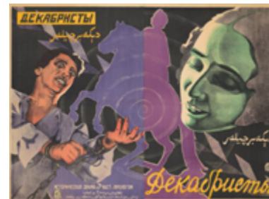
The Decembrists (1927)