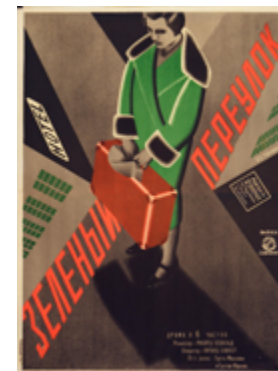
The Green Alley (1929), Vladimir & Georgii Stenberg